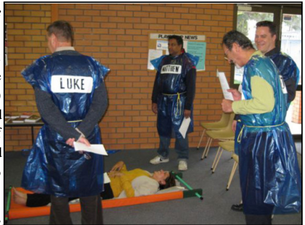
Above: Participant prepares to be "carried" by the Word of God - four burly evangelists.