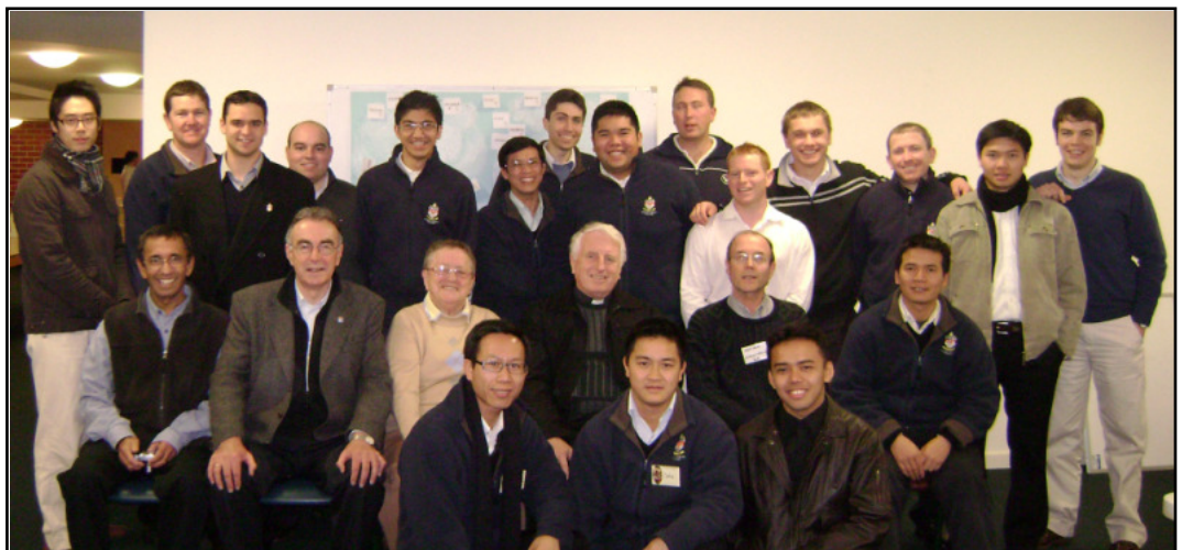
Above: The group of seminarians who took part in the Evangelisation Intensive course with some of the presenters. See page 6 for full report..

Don't miss the chance to be filled with the Holy Spirit, to become a more effective evangeliser and to enjoy the company of other disciples on fire with love for Jesus - Come to the PARISHES ON FIRE CONFERENCE!