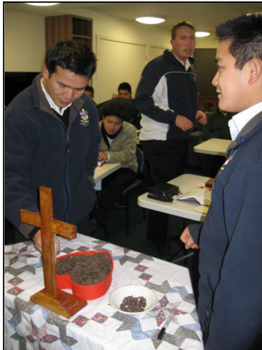
Above photo shows participants sowing seeds representing those they visited.

On the last two days, actual evangelisation took place, first in the Carlton vicinity and in the