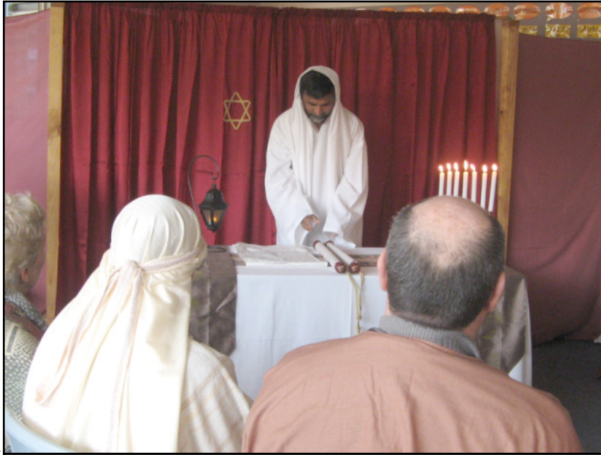
A synagogue scene - Emmaus course, Noarlunga S.A.

I decided to take up the challenge and attend the course. After all, it was only one weekend. The course quickly told me that I really only had part of the message of God in my faith. I learned that much of the New Testament is hidden in the writings of the Old