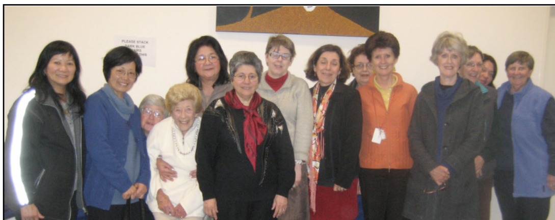
Above: Participants in the Personal Prayer course, Marrickville 2011