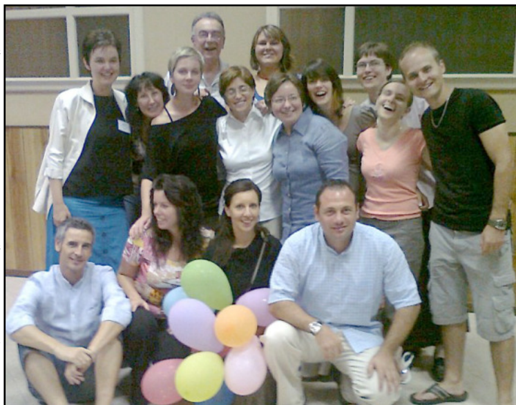
Above: Some of the happy participants at the Paul Course in Muzzano