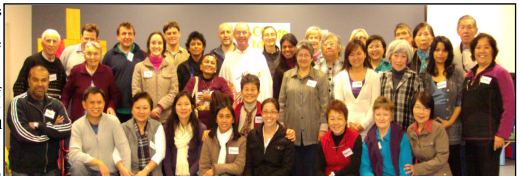
Above: Participants in the New Life Course, Waitara, N.S.W. - May 2011

It's my experience that the Holy Spirit is very economical, even the yucky times of our lives can be used to bring about a good in