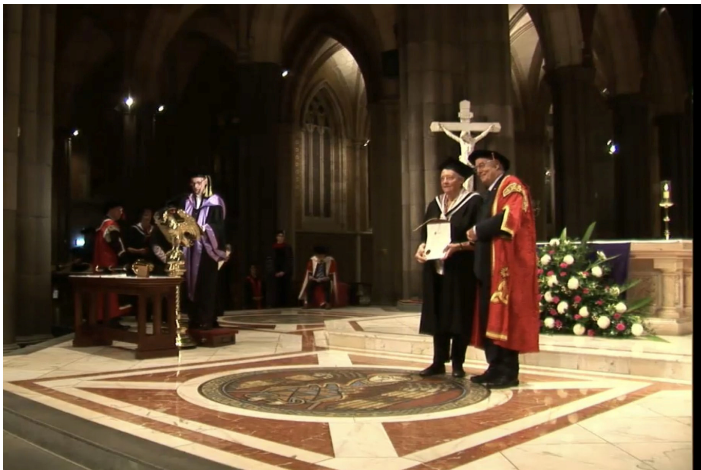
From the CSOE Rule.

Vision and Mission: (1) The vision of the Association is to be an instrument in the Catholic Church for the training of evangelisers in all Dioceses in Australia and to other countries.