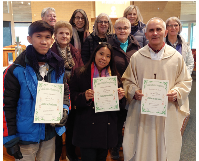
Jesus in the Four Gospels