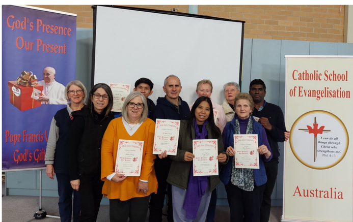
God's Presence – Our Present