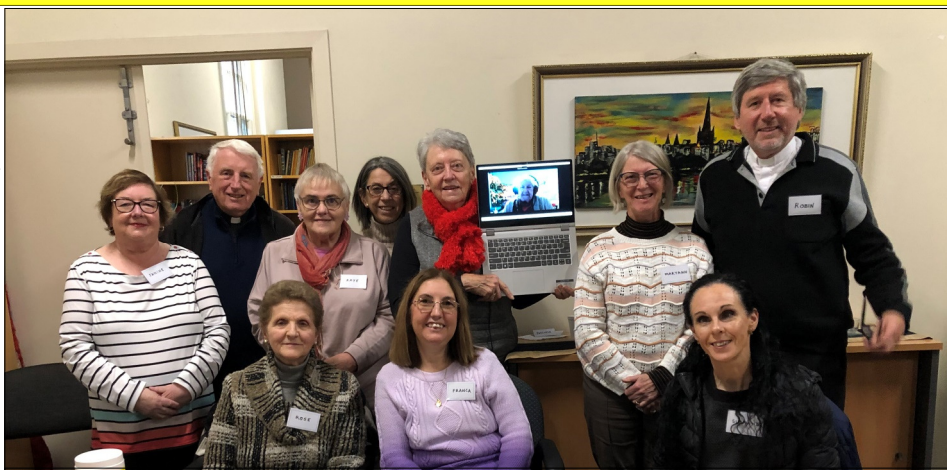
Photos of SOE team on their Reflection Day