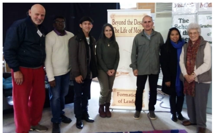
Beyond the Desert – The Life of Moses