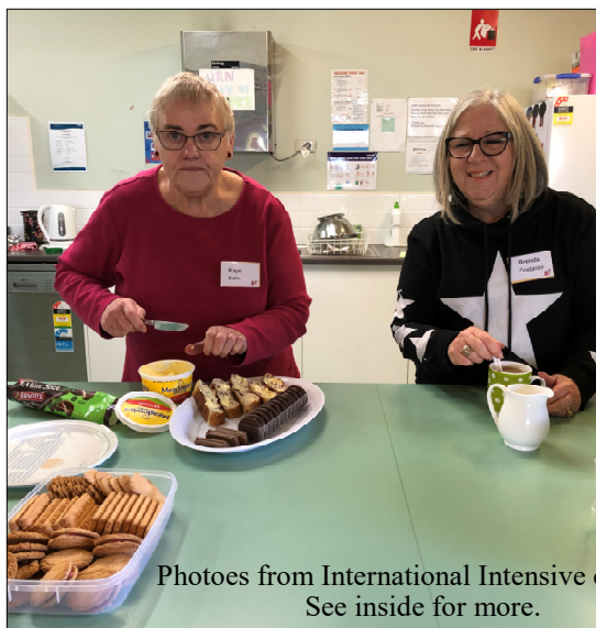
Photos from International Intensive courses. See inside for more.