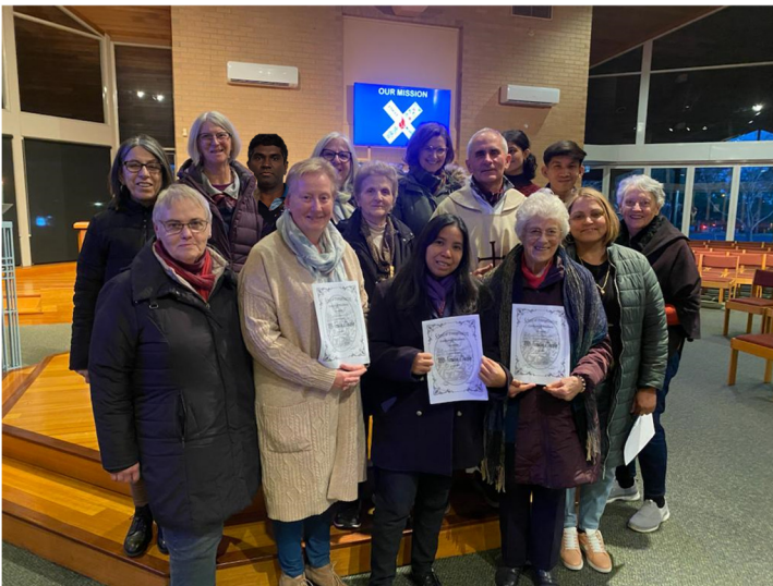
John the Beloved