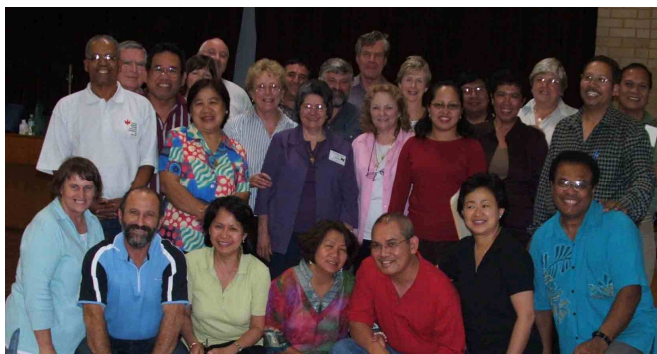
Participants in Teaching Course, Sydney.

A sincere THANK YOU for all your hard work in making us feel so loved and accepted and all those involved in the Melbourne SOE. All of you really showed us the true value of servanthood. We truly felt at home, among brothers and sisters who shared the same vision and mission mentality. No amount of money can repay your kind generosity and investment, not only in our lives, BUT ultimately in the lives of the Archdiocese of Cape Town, once we start with the establishing the SOE.