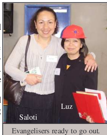
Evangelisers ready to go out.