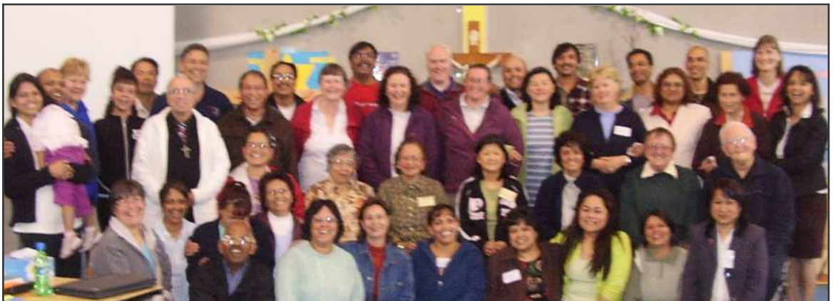
The enthusiastic group of evangelisers at the Narre Warren course.