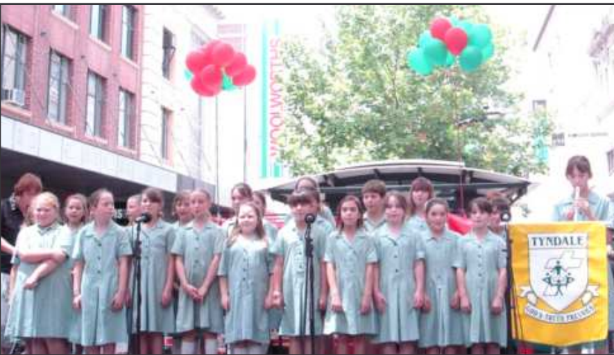
The Tyndale Christian School Choir

Phew..... A sigh of relief and a prayer of thanks. Once again we had proven that when God is on our