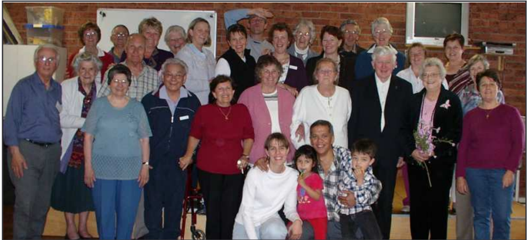
The happy group of participants at the New Life course in Newcastle.

A particular aspect of the course I really appreciated was the "dynamics". These, often interactive, practical demonstrations, really helped the course participants to appreciate and gain a deeper insight into the essence of the message being conveyed. I found many to be rich in symbolism especially during the talk of salvation where our sins were nailed to the cross and washed by the blood of Christ. I can fully appreciate the effort the team must have put into it as the dynamics require a